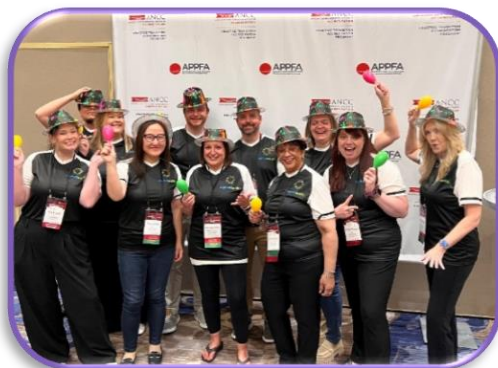
PTAP participants from Capital Health at the 2024 ANCC Accreditation Transition to Practice Symposium

Celebrating accreditation is important for several reasons. It is a significant milestone that demonstrates an organization's commitment to quality and excellence. Achieving accreditation can be a long and arduous process that involves the efforts of many individuals across the organization. The celebration helps to build trust and confidence within the organization's Nurse Residency Program, enhancing its reputation and credibility.