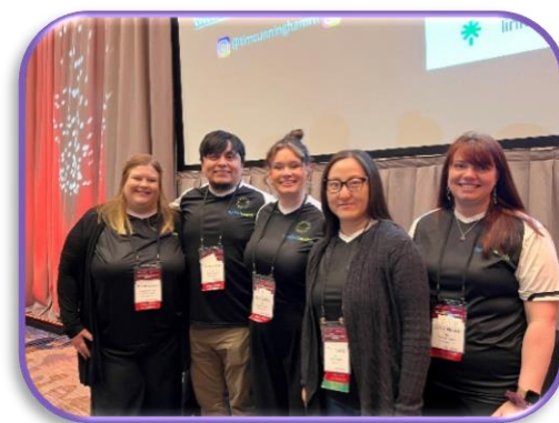
Past and Present Nurse Residents at Capital Health

Accreditation is not the end of the journey but rather the beginning of a commitment to continuous improvement. By celebrating accreditation, organizations reinforce the importance of quality and continuous improvement as core values. It encourages ongoing efforts to identify areas for enhancement and implement best practices to further improve the program. Accreditation is also an opportunity to acknowledge and appreciate the hard work and dedication of everyone involved, boost morale, help nurses feel valued, motivated and empowered in their roles, leading to improved job satisfaction, retention, and ultimately better patient re outcomes. As such, the nurse resident attendees were chosen because of their involvement not only within the nurse resident program, but because they have volunteered to assist during Nurse Resident Open Houses, RN orientation and to be nurse resident ambassadors for our future cohorts. The Capital Health nurse resident management team and nurse residents had a great time bonding together as colleagues and now friends during this wonderful symposium. We not only absorbed the great and motivating insights from the speakers during the day, we also celebrated our accreditation with other stellar institutions, while enjoying the delicious cuisine and culture that New Orleans has to offer.